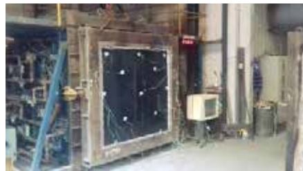
Test rig at two hours testing

Result was an insulation pass at 90 minutes and an integrity pass of 2 hours with no issues on either.