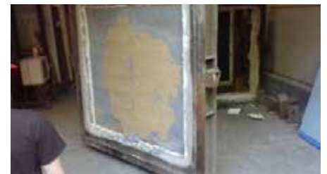
Back of test sample after two hours testing showing the furnace exposed face of the Fusion insulation